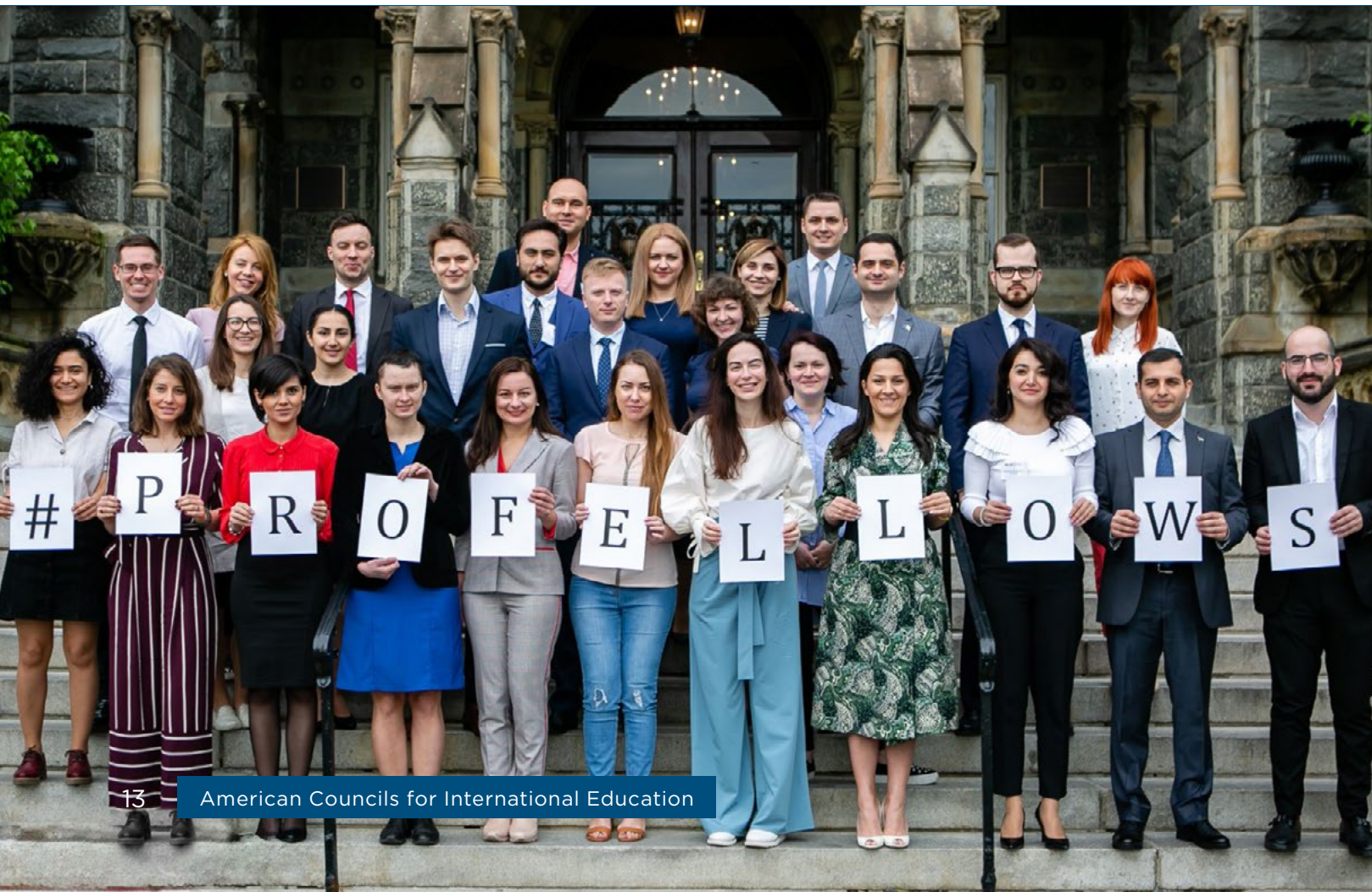
13 American Councils for International Education

Sponsored by the U.S. Department of State's Bureau of Educational and Cultural Affairs (ECA) and administered by American Councils, the Professional Fellows Program (PFP) for Europe and Eurasia is a two-way, global exchange that promotes mutual understanding, enhances leadership and professional skills, and builds stalwart partnerships between emerging leaders from foreign countries and the U.S. PFP participants are placed in intensive five- to six-week fellowships in non-profit organizations, private sector businesses, and government offices across the United States for an individually-tailored professional development experience.